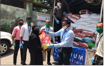
(Essential food distribution in cyclone affected areas in Raghunathpur (Odisha), Medinipur East (West Bengal) and in Covid affected areas of Kalyan & Khopoli in Maharashtra)